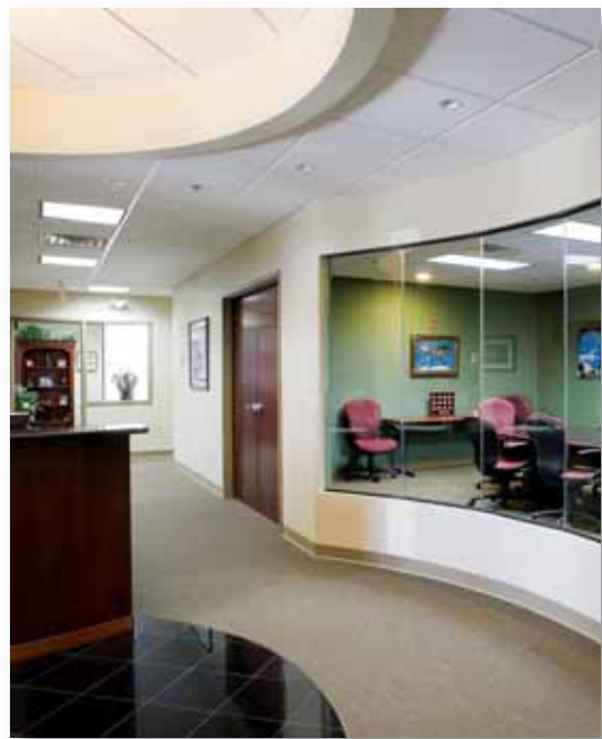
Top Right: Private Ice Rink, Fairfield County, CT Top Left: Hopewell Plaza, Hopewell Junction, NY Bottom Right: Creative Mailing Services, Monroe, CT