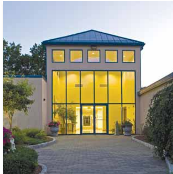
Top Left: 121 Restaurant, Oxford, CT Top Right: SCB Office Building, Newtown, CT Bottom Left: BMW of Bridgeport, Bridgeport, CT Opposite Page: Bulk Materials, Inc., Newtown, CT