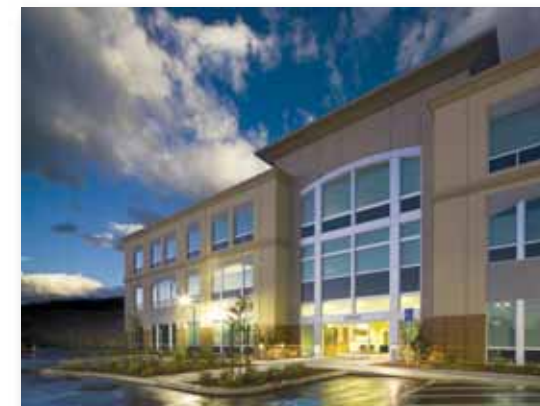
Top Right: Newtown Youth Academy, Tilt-Up Construction, Newtown, CT Top Left: Francis Clark Park, Tilt-Up Construction, Bethel, CT Bottom Left: Courtesy of the TCA