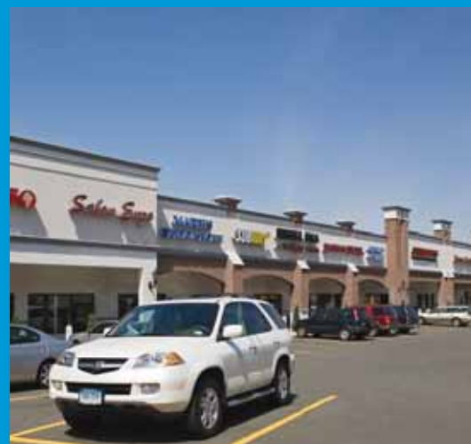
Top: Wachovia Securities, Danbury, CT Top Left: Fairfield Woods Plaza, Fairfield, CT Bottom Right: Key Hyundai, Milford, CT

We're ready to respond to the unique needs of your building project. Better listening means more strategic thinking and more tangible results.