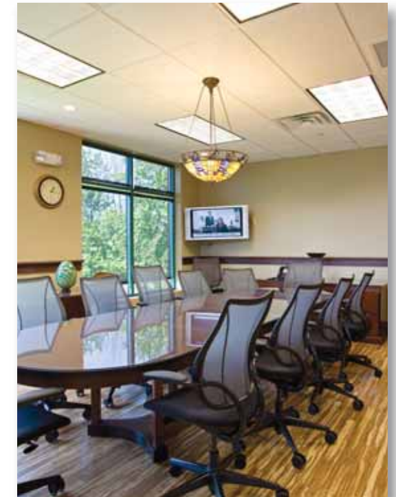
Above: Wachovia Securities, Danbury, CT

Our team provides innovative solutions to make each project environmentally friendly, energy efficient, and sustainable. As members of the U.S. Green Building Council and with LEED® Accredited Professionals on staff, Claris is able to assist any client with LEED CERTIFICATION .